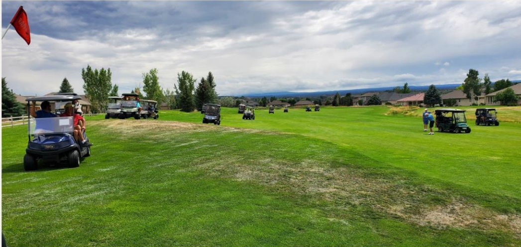
Member Guest Horse Race, July 23, 2022

THE OFFICIAL MONTHLY NEWSLETTER OF COBBLE CREEK