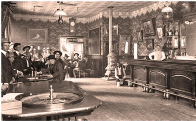
Cosmopolitan Saloon & Gaming Hall, Telluride, Colo.