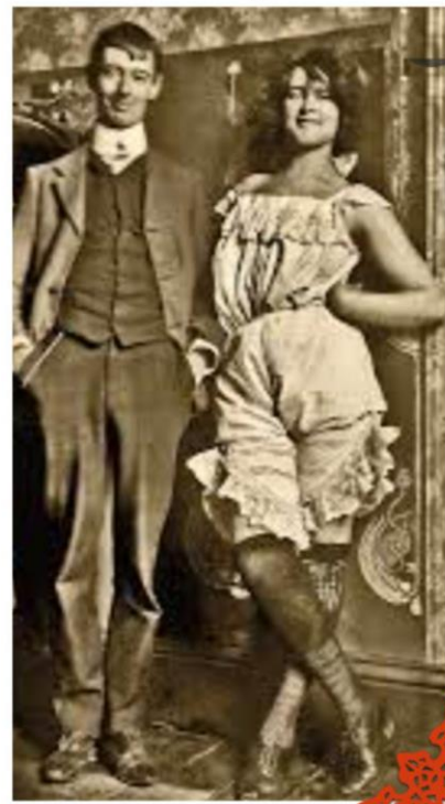
Squirrel Tooth Alice & Customer