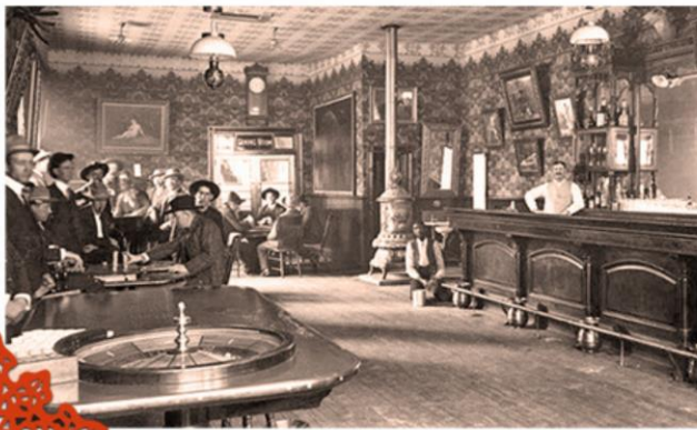
Cosmopolitan Saloon & Gaming Hall, Telluride, Colo.